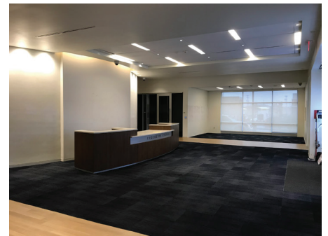
Spacious lobby area