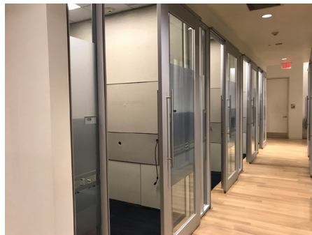
Current build out includes private offices and conference rooms with a contemporary design