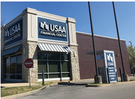
Includes a drive thru access